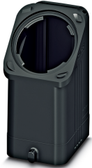
HEAVYCON EVO sleeve housing, plastic, with bayonet flange for EVO screw connection, B6, for single locking latch, height: 87.5 mm, without EVO screw connection

Please be informed that the data shown in this PDF Document is generated from our Online Catalog. Please find the complete data in the user's documentation. Our General Terms of Use for Downloads are valid ( http://phoenixcontact.com/download )